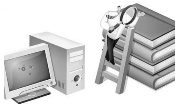
Figure 2 Integrated teaching