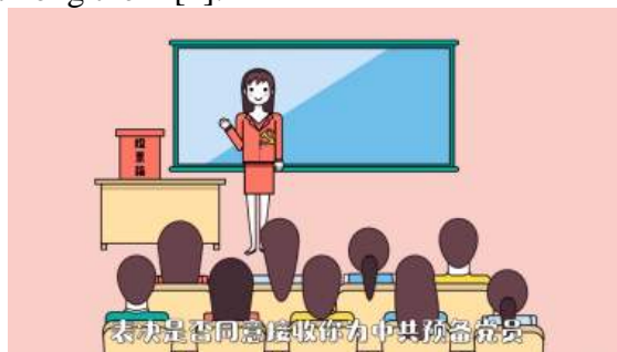
Figure 1 Ideological and political education

In order to meet the needs of social development and cultivate applied and social-oriented talents, the teaching field of our country has gradually begun to pay attention to the teaching quality and efficiency of party building and ideological and political education. In view of the fact that the Party building work and the ideological and political teaching content are both involved in adhering to Mao Zedong's thought and the Party's leadership and have the same work goal, it is very feasible and crucial to explore the teaching strategy to realize the common development between the two, and then exert the synergy among them [1].